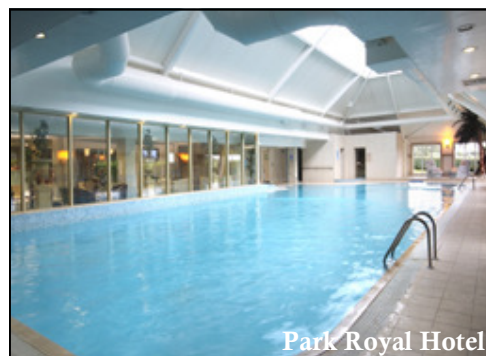
Park Royal Hotel

How to Book - Please call Hanson Exclusives on 0113 239 3300 to reserve a room.