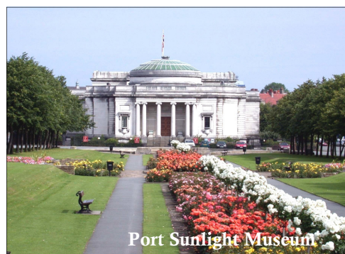
Port Sunlight Museum