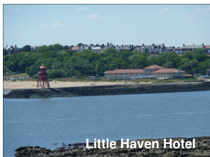
Little Haven Hotel

Considered one of the finest musicals ever written, the score includes Some Enchanted Evening , I'm Gonna Wash That Man Right Outta My Hair and There is Nothin' Like a Dame .