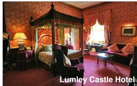
Lumley Castle Hotel

This magnificently preserved castle dates back to the 14th century. No castle worthy of its place in history is complete without its secret images of the past! The accommodation is regal, the service discreet and from the moment you arrive at the softly lit, dramatically draped reception you realise that this is no ordinary hotel.