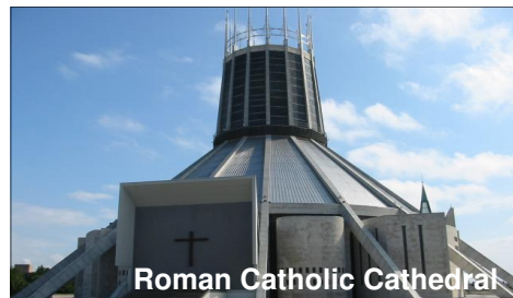
Roman Catholic Cathedral