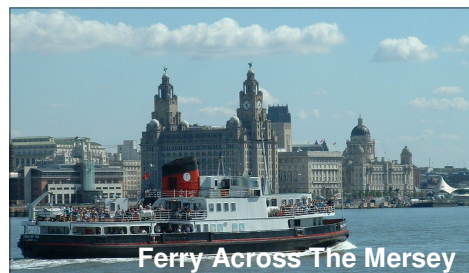
Ferry Across The Mersey