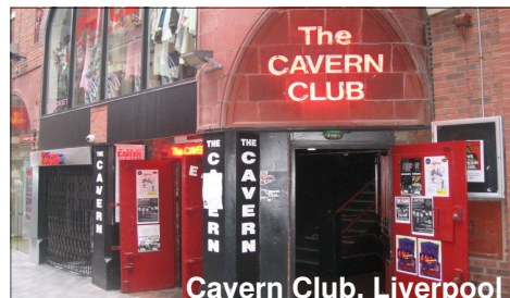
Cavern Club, Liverpool